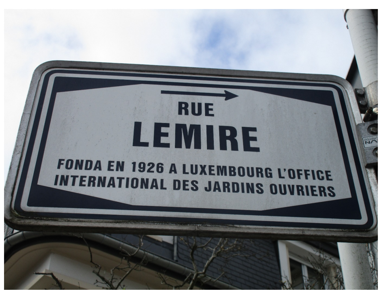
road sign in Luxembourg-Belair