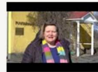
Den skräddarsydda kursen för kolonister