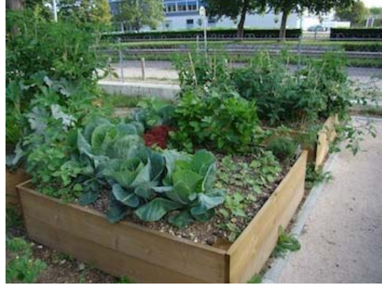
View from the site entrance