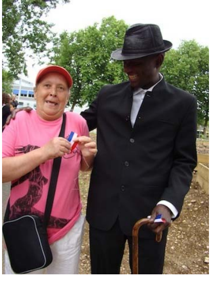
The happiness of the new gardeners