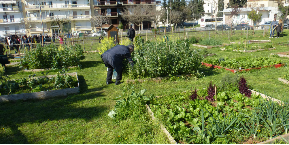
Image 2 - Kipos3 community garden, Thessaloniki, Greece.