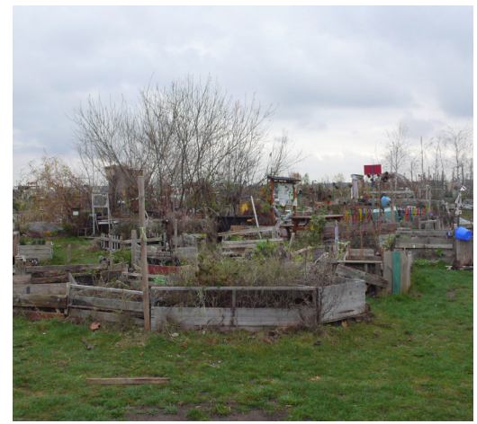
Image 3 - Allmende-Kontor community garden 1 , Berlin, Germany.