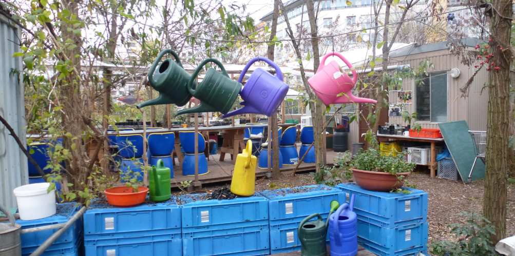
Image 4 - Prinzessinnen community garden, Berlin, Germany.