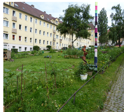
Image 5 - Huttenplatz community garden, Kassel, Germany.