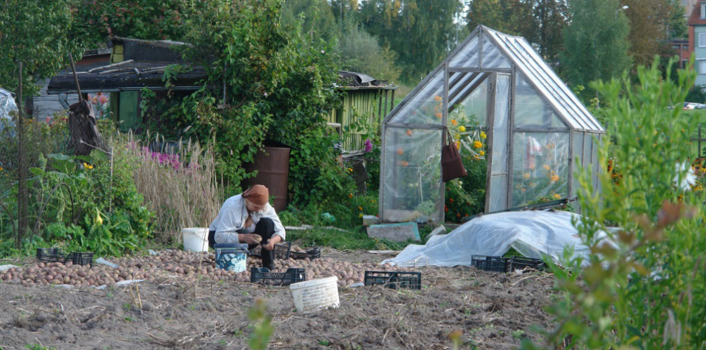
Image 2 - Provisioning garden, supply of local fresh and healthy food, Cesis, Latvia.