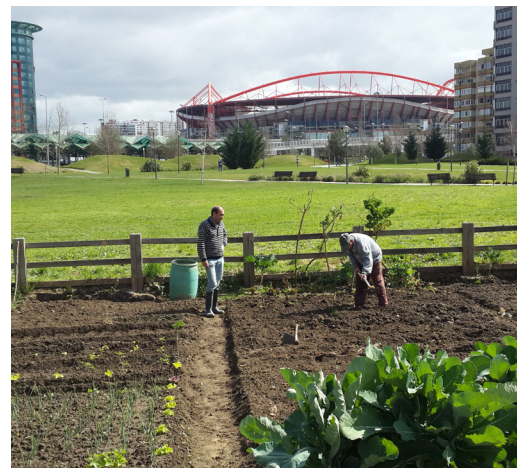
Image 3 - Ecological corridor, Lisbon, Portugal.