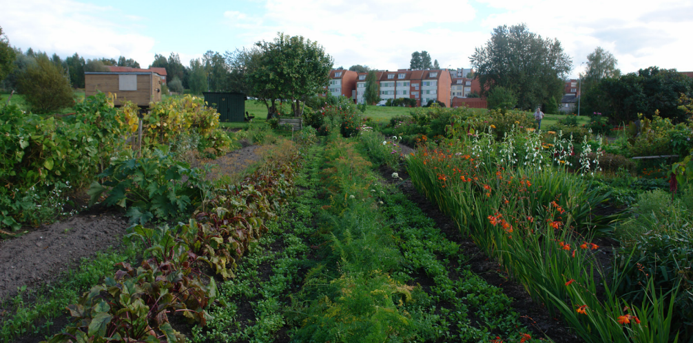
Image 4 - Habitats and biodiversity, Cesis, Latvia.