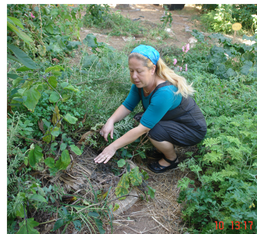
Image 5 - Connection to nature. Haifa, Israel.