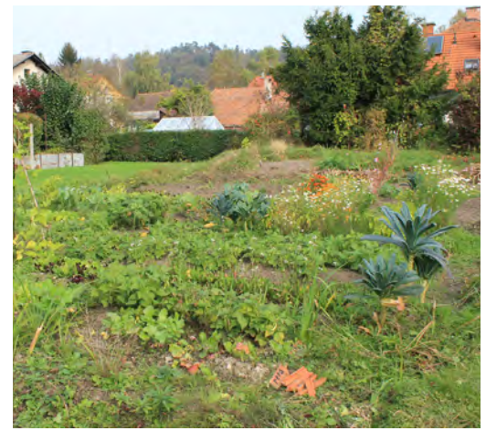
Image 3 - Anarchist design 1 , Community Garden, Ljubljana, Slovenia.