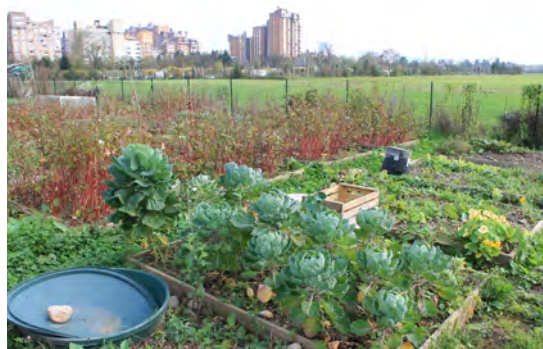
Image 4 - Four Plots in a row with water collection tank rented by individual gardens for education on crop rotation in Ljubljana Private Allotments.