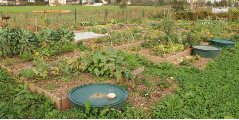
Image 2 - Landscape Designer work for organic crop rotation in educational garden plots, Ljubljana Private Allotment Education Gardens, Slovenia.