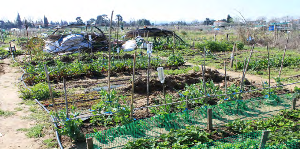
Image 5 - Personalised design of plots by gardeners, Thessaloniki Allotment Gardens, Greece.