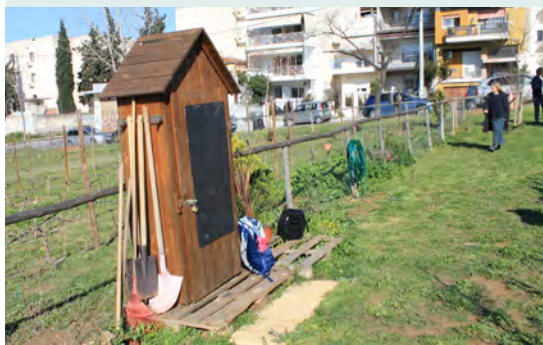
Image 8 - Tool House in Thessaloniki Kipos3 garden, Greece.