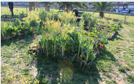
Image 7 - Planted Plots in Thessaloniki Kipos3 garden, Greece.

trails, local food restaurants and farmers' markets and public transport are only some of the urban layers that urban designers are capable of putting together to provide you with suitable solutions.