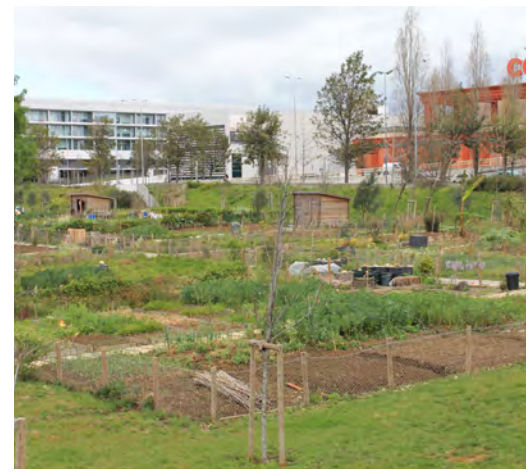
Image 6 - Designed allotment, Quinta da Granja, Lisbon, Portugal 2 . Photo: Dimitra Theochari