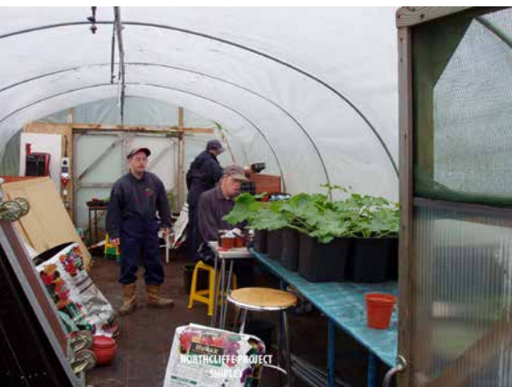
Community garden - The Northcliffe Project for people with disabilities.

President National Allotment Society (NAS)