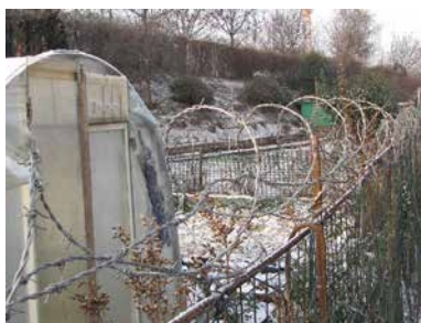
„Fortified gardens" in the suburb of Paris. They do everything they can to discourage visitors!