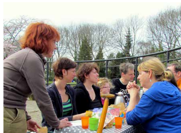
Planning the work in spring in the community garden

The expertise of allotment horticulturists has been rediscovered, gardeners themselves learn to look, think and do things differently. Gardening and growing food require knowledge, patience, dedication and creativity. All this can be learned. Recently, local governments in The Netherlands have been considering how to give a future-oriented answer in a so-called food strategy. Someone who wants to feed on the harvest of their own cultivated crops has to grow 40 m 2 all year round, according to the University of Wageningen. That will not happen in a city nowadays. Although Esther Veen showed in the thesis of "Community