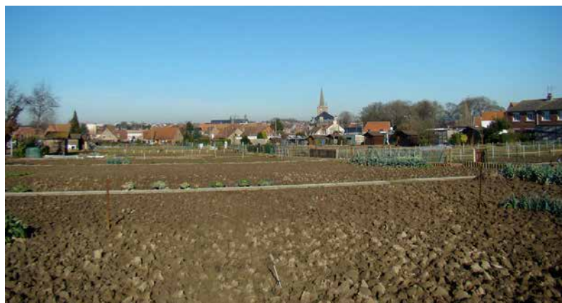
Traditional allotment site in Hasbrouck (North of France). The plots are big and entirely dedicated to vegetable cultivation.