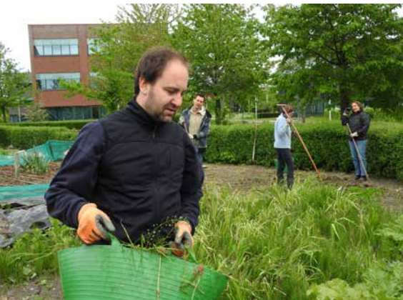
in an allotment park, preparing the foodgarden for a new season

Nowadays we observe a strong relationship between new forms of organised community gardening – such as urban agriculture, neighbourhood gardens, natural gardens, food gardens – and the longer existing allotment gardens in the Netherlands. How can this be explained?