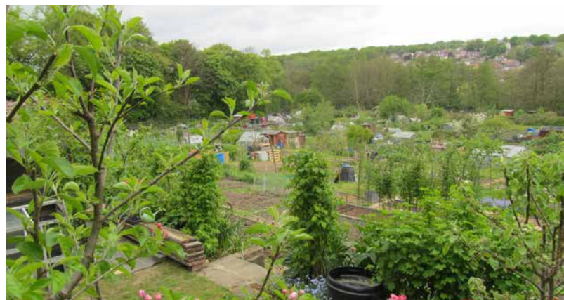
An allotment site.