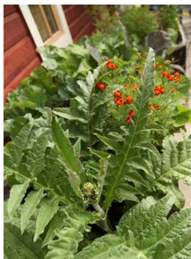
Artichoke and Tagetes Linnaeus