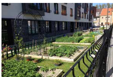
Gardens at the bottom of a block of flat houses in Saint Martin-lès-Boulogne (North).