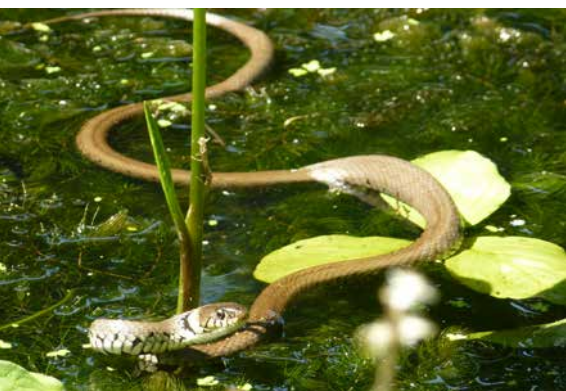
Nature in the gardenpark

tended for use by nearby residents. Unfortunately, community gardens are often of a temporary nature, on brown field land where, for example, houses have to be built. However, we observe partnerships and large-scale social enterprises based on the rediscovery of gardening. Nature and environmental organisations are reviving with new energy and attracting a lot of volunteers.