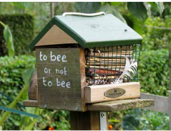
b&b in an allotment