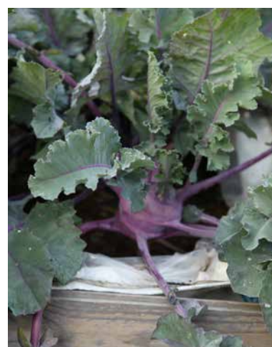
Turnip cabbage (Kohlrabi/ German turnip)