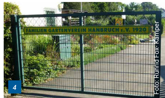
Typical allotment garden in Aachen, Germany, founded 1920.