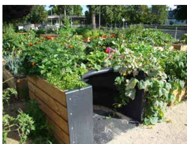
A abundant flowering square gardens of the Fontaine d'Ouche in Dijon (21) two months after their inauguration.