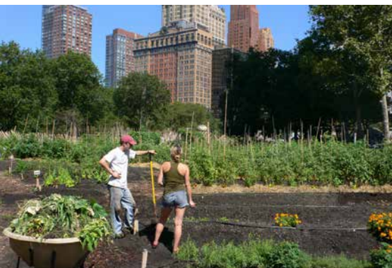
Community gardens at the heart of Manhattan – open for all citizens and active garden users. The small gardens of the “Urban Farm at the Battery” are within easy reach on foot from Wall Street and Broadway.