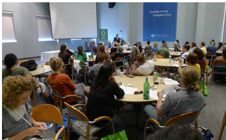
Lectures, working groups, discussions

Since nearly four decades around 400 garden activists have been gathering yearly at the occasion of the meetings of the American Community gardening association (ACGA).