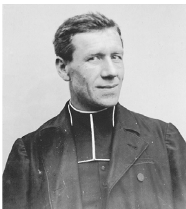
Portrait of priest Jules Lemire, founder of the French allotment federation in 1896.