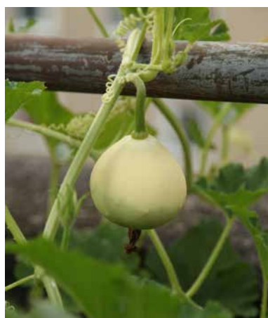
Winter squash on the roof.