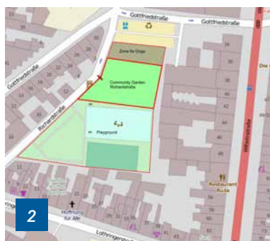
Site plan of the Community garden HirschGrün, Aachen, Germany.

Poland, but again they are being used primarily as leisure gardens (Figure 5). In some countries (such as Latvia), many of these gardens are now threatened by vacancy and / or abandoned in favor of urban development projects.