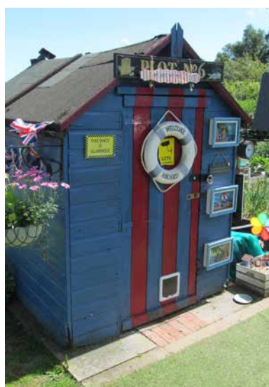
The English eccentrics shed.