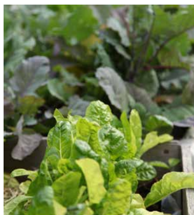
Salad on the roof