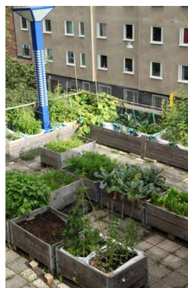
View over the cultivation on the roof.