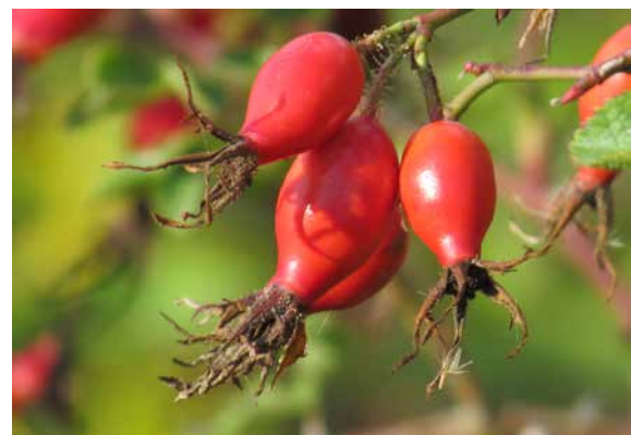
Wild fruit in the allotment