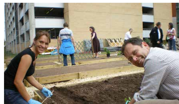
Allotment plots, city centre for employees of businesses.