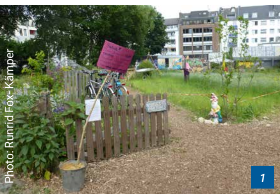
Community garden HirschGrün, Aachen, Germany