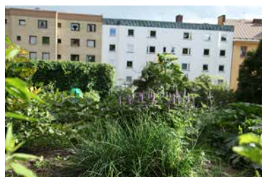
The forest garden part of the Høeghild Urban Garden is located below the Church, only a few meters from their roof cultivation.