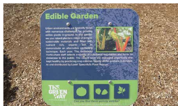
The visitor learns so more on a nature friendly cultivation of vegetables and mixed cultivation. The harvest is donated to relief organisations.