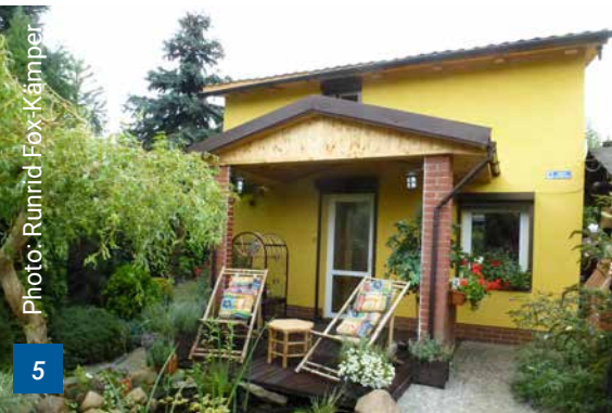
Allotment garden plot in Poznań.

cent economic crisis of 2008, that affected the economic conditions of the population of these countries (Figure 6). In contrast to the times of industrialisation, this does not seem to be a question of the cultivation of essential food. Explorations on the motivation of the gardeners on an allotment site in the surroundings of Athens, founded in 2012 (Anthopoulou 2016) show, for example, that the gardeners place their first priority on their physical and mental health ("healthier and more conscious eating" "movement in the fresh air") or the special life situation of often unemployed gardeners ("developing a local identity", "making something meaningful", "ways out of isolation"). This study confirms the assumption that the motivation for urban gardening in a European context is less based on a forced self-sufficiency, than above all on the desire for a healthy lifestyle and participation. Clearly, there are parallels between