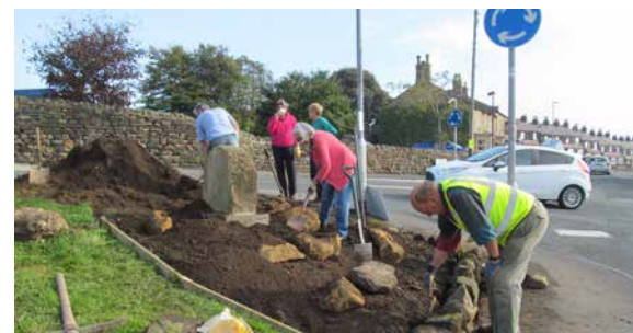
An 'In Bloom' group preparing a flower bed.

A variation on this is where an Association is formed for the benefit of the site and acts as the representative.