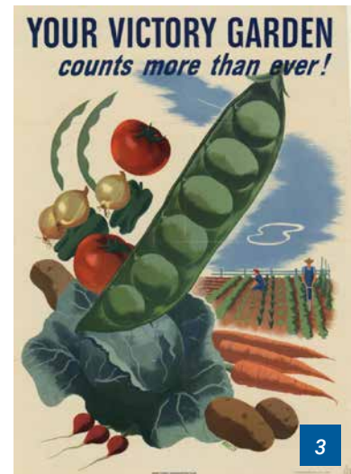
Poster „Your Victory Garden counts more than ever!“

Up to now, in a European comparison, relative to their population, most of the allotment gardens are located in