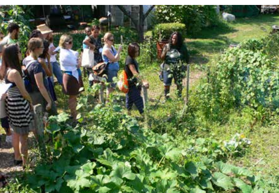
Community gardens are an answer to the global economic crisis too – Congress participants visit the “Bed Stuy Farm” in Brooklyn.

age allotment garden properties. So, a conflict of interest between “construction” on one side and the “protection of green spaces” on the other side, was predestined.