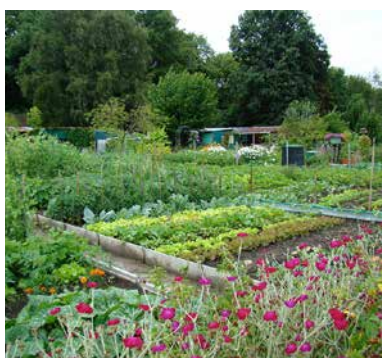
Traditional family garden in Versailles, where you can find vegetable and flower cultivation as well as some fruit trees.