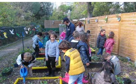
School garden in Mazargues (Marseille).