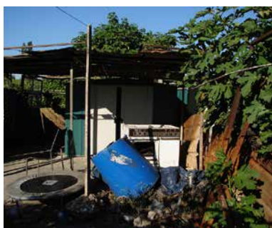
"Shanty garden" in Nîmes. Model of a garden that is responsible for the bad image of allotments and everyone wishes its disappearance.