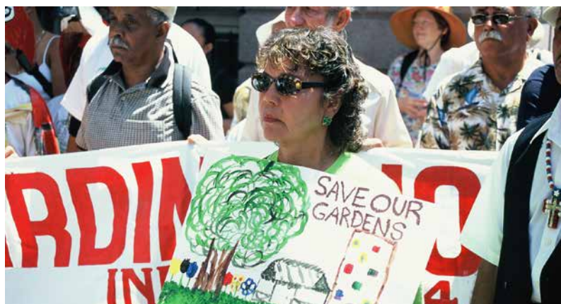
Citizens and participants of the ACGA-conference protesting in 2002 for the obtainment of community gardens in NYC.

When at the beginning of the 1990s properties in several neighbourhoods – including the Bronx – gained in value because of the influx of newly rich citizens, numerous gardens were destroyed, to make way for the construction of new buildings. In 1991 the New York City Housing Authority announced their intention to build 35 new public housing flats on garden grounds. The garden area originally has been founded by a youth organisation. The project name „The Dome – Development of Opportunities through Meaningful Education“ was sponsoring the social programme of this gardening community. The users of the garden then were well aware of the necessity of social housing. So, because there were 13 suitable vacant lots in the local area – without gardens – they proposed to use these lots as an alternative for their construction