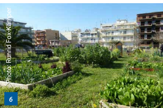
Kipos3-community garden with single flowerbeds in Thessaloniki

Since the mid-1970s, the French federation of allotment gardens (Fédération Nationale des Jardins Familiaux et Collectif – FNJFC) has been trying to counter the constantly decreasing number of allotment gardeners in France. First of all, it was about adapting the attractiveness of the existing garden facilities to the needs of today's families and their ideas of life.