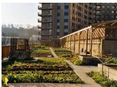
Shared gardens in Boulogne Billancourt (92 - Hauts-de-Seine).