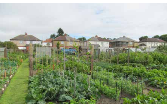
An allotment plot.