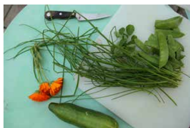
Harvest of the evening

The manicured plants have deep green prosperous leaves, berries and fruit. The growers are harvesting beans, cucumbers, beets and chives for all. A light rain is falling, but it doesn't matter much. Soon the sun is shining again, and the growers eat heartily.