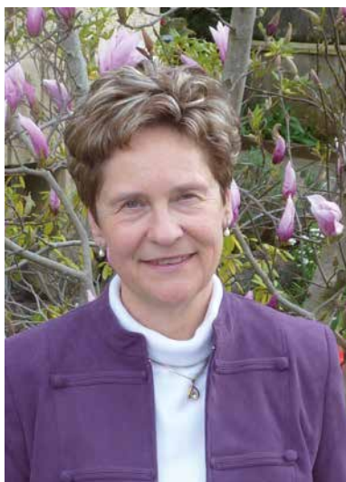
Secretary General Office International du Coin de Terre et des Jardins Familiaux a. s. b. l.

In April / May 1988 the first issue of the Hyphen, our international magazine was published. It was first issued by the Office, then thanks to the help of a federation and finally turned into a professional publication. Since already thirty years, the Hyphen has been spreading news from the Office and the federations, as well as information, on a regular basis – first twice than three times a year. It also enables the federations to present themselves and their projects, deals with problems and gives suggestions.