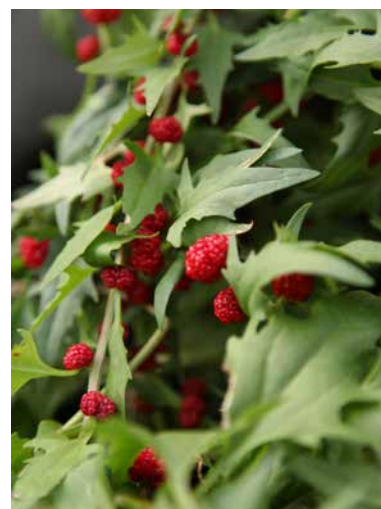
Blitum virgatum/Leafy goosefoot