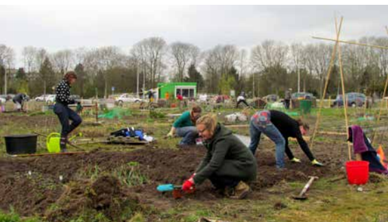
Making a temporary community garden.

were good at exchanging knowledge both in the area of the ornamental garden and the vegetable garden. Some garden sites stimulated visitors to enjoy the splendour, as an act of social behaviour towards non-gardening people. For many years, the AVVN has advocated that garden associations should open themselves to the outside world, not only from a social point of view but also in order not to become isolated. At that time unfortunately with little success.