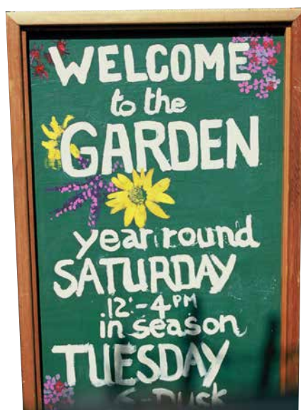
Visitors are cordially welcomed.