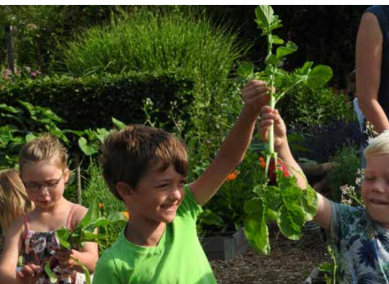
kids yielding in their kidsgarden in an allotment