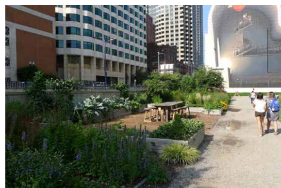
Edible gardens in the public green areas in Boston.