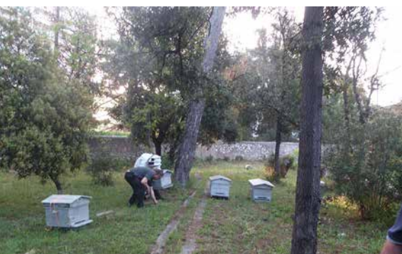
Voluntary gardeners install the beehive in the middle of the pine forest on the Mazargues allotment site.