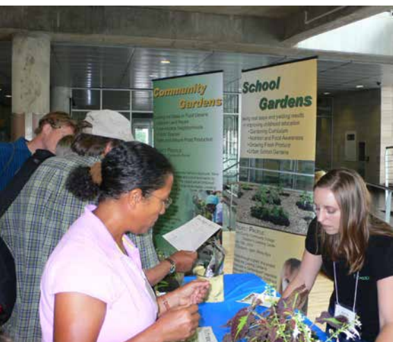
During the ACGA meeting several environment protection organisations inform on their social and ecological projects

Director of the national allotment federation Westphalia-Lippe