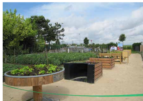
Several types of plots for disabled people in Quetigny (21).

b) Shared gardens: These gardens are often established on land that is meant for future building projects, thus they tend to be ephemeral. The gardeners do not have to sign a contract with an association. They may come and go at any time. Everything is informal: no fee, no individual plots, no equipment. The land on which they settle sometimes does not exceed 100 m 2 . The growing and harvesting of the vegetables are shared between the members. Social relationships are more important than feeding the members who usually belong to the middle class. It seems obvious that these gardens are a long way from the allotment gardens that were imagined by priest Lemire and whose main function was to feed the poor working-class people. Community gardens are based on a political project.