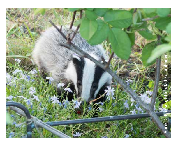
In the night the badgers come out looking for something to eat. During the day they sleep under a cabin. At Etterstad there are permanently 2-3 badge dwellers. Children find this very exciting.

In addition to all the cabins in the garden, the "House" is a gathering place for the members at the annual autumn party and spring festival and on different other occasions. The House can also be rented by the members of the association for baptizing ceremonies, birthdays, confirmations, weddings etc. The garden also has a small pavilion as well as a separate house with toilets, showers, washer and dryer. The common house was completely renovated in a joint effort by the inhabitants themselves 2012/2013.