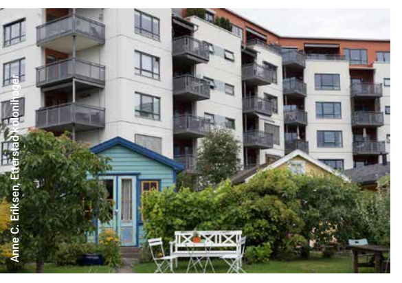
It is not far between the allotment garden and the blocks behind. The garden is situated in the middle of an urban area.