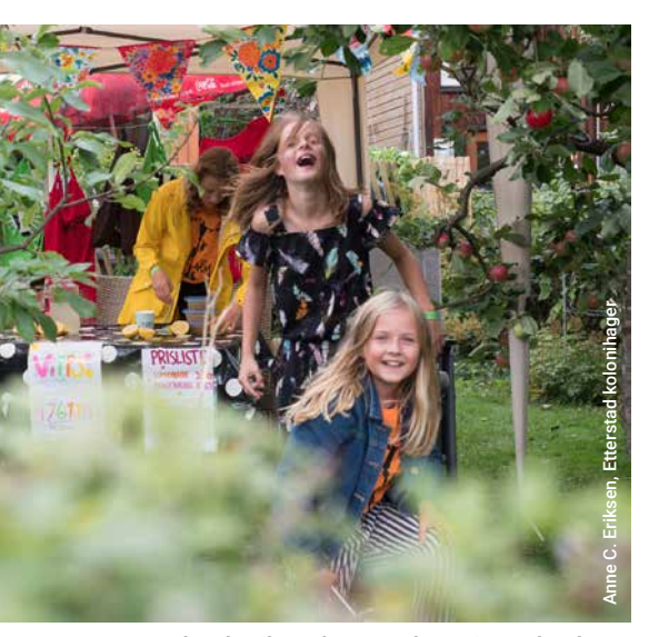
Etterstad Kolonihage's annual music and cultural festival Hagelarm is organised in August with activities on a main stage and on several garden spots. There are concerts, exhibitions, painter workshop, fruit and vegetable and delicious local food on offer. The festival is well-visited, regardless of weather. The girls in the picture sell homemade lemonade.

There is much to be done in the allotment garden. Every summer the garden site organises its own music festival - Hagelarm. The programme is large and varied with music and cultural experiences for young and old. Most strikingly you may enjoy different events in and around individual cottages, in addition to everything happening at the "festival place" by the common house. At the festival square you will also be served delicious homemade food and cold and hot beverages at a reasonable price.