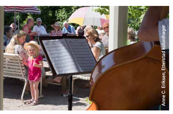
Live music in the summer for members and neighbours, for young and old.

The public areas of the garden are also used for recreation by many in the local area. The association has a particularly good relationship with "Vålerenga Living and Service Centre" (for elderly people). The garden members arrange every year and several times during the season flea markets, whereby the city's population is invited for a guided tour of some of the gardens with subsequent coffee and cakes. The garden is open to the public from 9 am - 21.00 pm in the summer season.