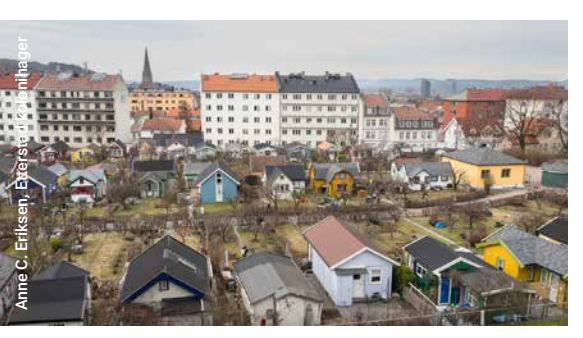
Etterstad allotment garden site is located at Oslo's East End and surrounded by block buildings. The overview shows part of the garden in April.