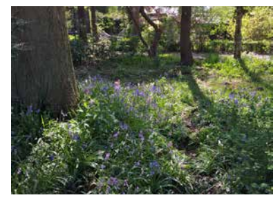
Flower meadow and Stinzengarden

per, glass, batteries, metal and residual waste are collected separately.