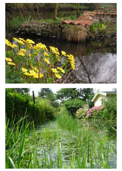
Natural banks and ditches