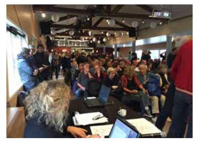
Information and education sessions