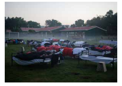
The Open Air Allotment Hotel