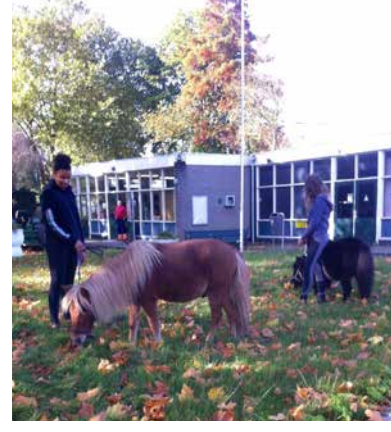
Joint use of the lawn

Subsequently, trees, shrubs and plants with an ecological added value have been planted. Other examples of nat-