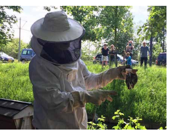
One of the beekeepers