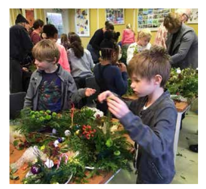
Education for school children: making Christmas pieces with material from the garden.