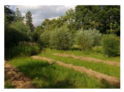
The meadow after mowing with the scythe