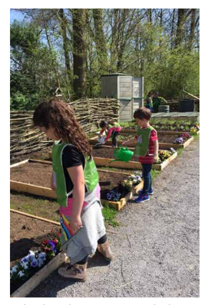
School gardens at Nooit Gedacht

Flower Clock in the flower circle. In the various borders are annual flowers such as viper's bugloss and snake and white mignonette.