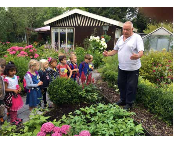
Children in the garden