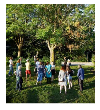
One of the many excursions

In addition, the following teams are active: Nature & Education, The Shop, "Green Pleasure" Nursery Garden, Compostello, Water Quality and Birds Nesting. The latter focuses on construction and maintenance of hiding and nesting areas, such as the kingfisher wall, sparrow flat nest boxes, hedgehog houses and insect hotels. The beekeeper provides four beehives. The Shop has been repainted with organic paint. It now has a sus-