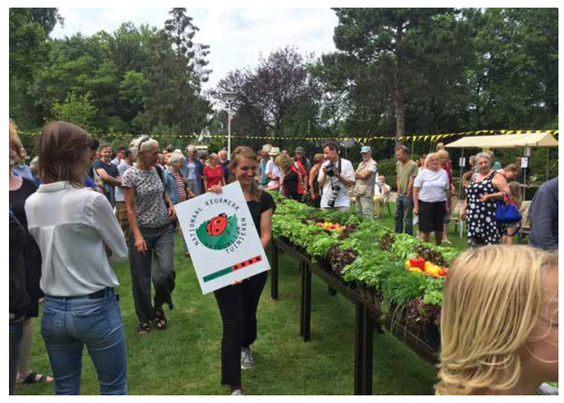
Award of the National Quality mark Natural gardening

are Open Garden Days where the gardeners open up their little paradises. Also there are extra activities, such as the Open Air Allotment Hotel.