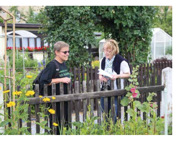
Saxony Dresden Population: 551.072