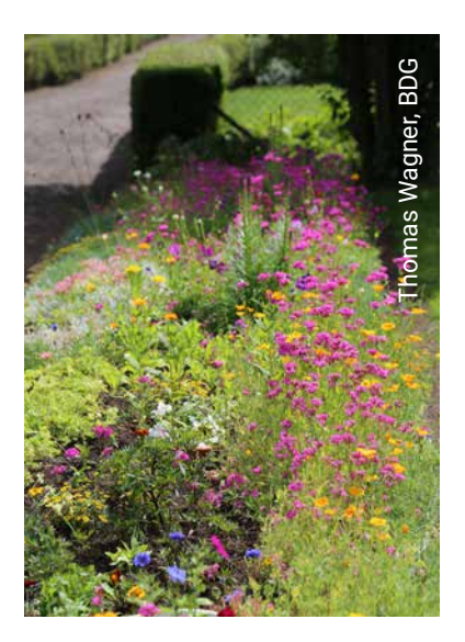
Soil that is covered all year round stores water and helps build a stable soil structure.