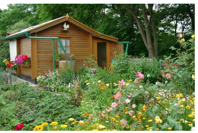
Soil care and protection are essential to strengthen the resilience of gardens to adversity in wind and weather and other stressors.

Researcher, Federal Association of Allotment Gardens in Germany e.V.