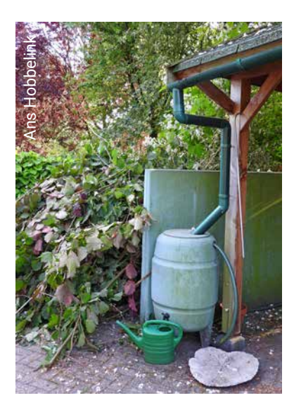
This shelter is used to collect rainwater.