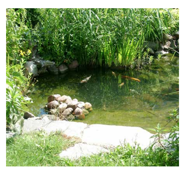
In a pond or with rain barrels, valuable rainfall can be collected and used for watering.

The effects of climate change, which have been increasingly felt here for years, such as rising temperatures, periods of heat and drought, as well as increased heavy rain and extreme weather events, have an impact on the animal and plant world, on chemical, physical and biological processes. The growing season in Berlin, for example, is starting almost a month earlier compared to 1931. Gardeners, farmers and forest managers are affected.