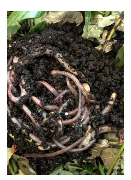
The strengthening of biodiversity in the garden also promotes beneficial insects, speaking of containment of pests in the garden.

Of course, one needs knowledge and practical experience to understand the interrelationships in plant and animal