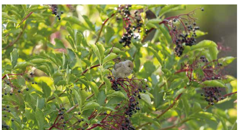
blackcap in an elderberry bush

As soon as the climate hedge has grown and started to flower, it can be used as a living climate meter. The 10 species of the climate hedge function as extremely sensitive measuring instruments of the atmosphere close to the ground and, with their times of flowering or fruit ripening, show year after year exactly how climate change is affecting our doorstep and when the 10 natural seasons are coming into the country. The natural year has 10 instead of 4 seasons, which are not heralded by a fixed date, but by natural phenomena such as leaf sprouting, flowering or fruit ripening. This natural development depends above all on temperature, sunshine duration and precipitation and can be precisely observed on the 10 plants