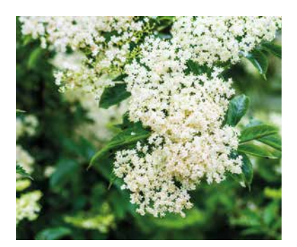
Blossoms of the black elder

The Climate Hedge consists of 10 native woody species, all of which are guaranteed to be of regional origin and whose parents are at home as wild shrubs in the regions of eastern Austria. The regional origin of the plants is important in order to obtain a regionally typical natural development for one's own climate observations. The following overview shows which indicator function the individual plants have for the arrival of which natural season.