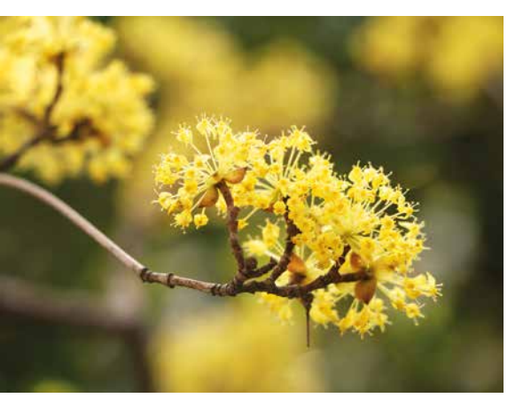
blossom on the Cornelian cherry

If you want to know how the climate around your own garden is changing, you can either buy expensive temperature and climate measuring devices, read meta-studies and expert reports, or you can plant an ingenious climate hedge with 10 native woody species.